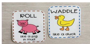
DOWN ON THE FARM gross motor movement game

We will be updating our story/rhyme display board with an "Old Macdonald display" as this is one of the children's favourite rhymes. This will be linked to learning all about farmyards and animals. The children will be getting creative using a variety of media to make farm animals and enjoying small world play with animals and resources such as shredded wheat for hay bales and real straw for the pigsty, compost and grass for the other farm animals.